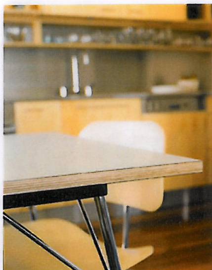
TABLE TALK When the idea for a fixed breakfast bar was changed, the owner went shopping for statement-making dining room furniture, such as the six-seater table and chairs by Charles & Ray Eames. Both the tabletop and chairs are made of plywood and have metal legs, and so match the two main materials used in the kitchen: hoop-pine plywood and stainless steel. Luke Design 'Eames' dining table with laminate top in White, from $2625, from Spence & Lyda, (02) 9212 6747. Herman Miller 'DCM' dining chairs in Light Ash by Charles & Ray Eames, $633 each, from Living Edge, (02) 9212 3542.

The Madinoz D-handles from Style Finish – call (02) 9957 6344 – and the power points and appliances have been finished with stainless-steel plating. The single shelf below the cupboards provides storage for glasses and is set back to allow plenty of preparation room. Ilve 600WMPSS oven, $2399, H360CSS cooktop, $979; partially-integrated AEG 860501M dishwasher, $1499, all from Winning Appliances, (02) 9698 8099, www.winningappliances.com.au .